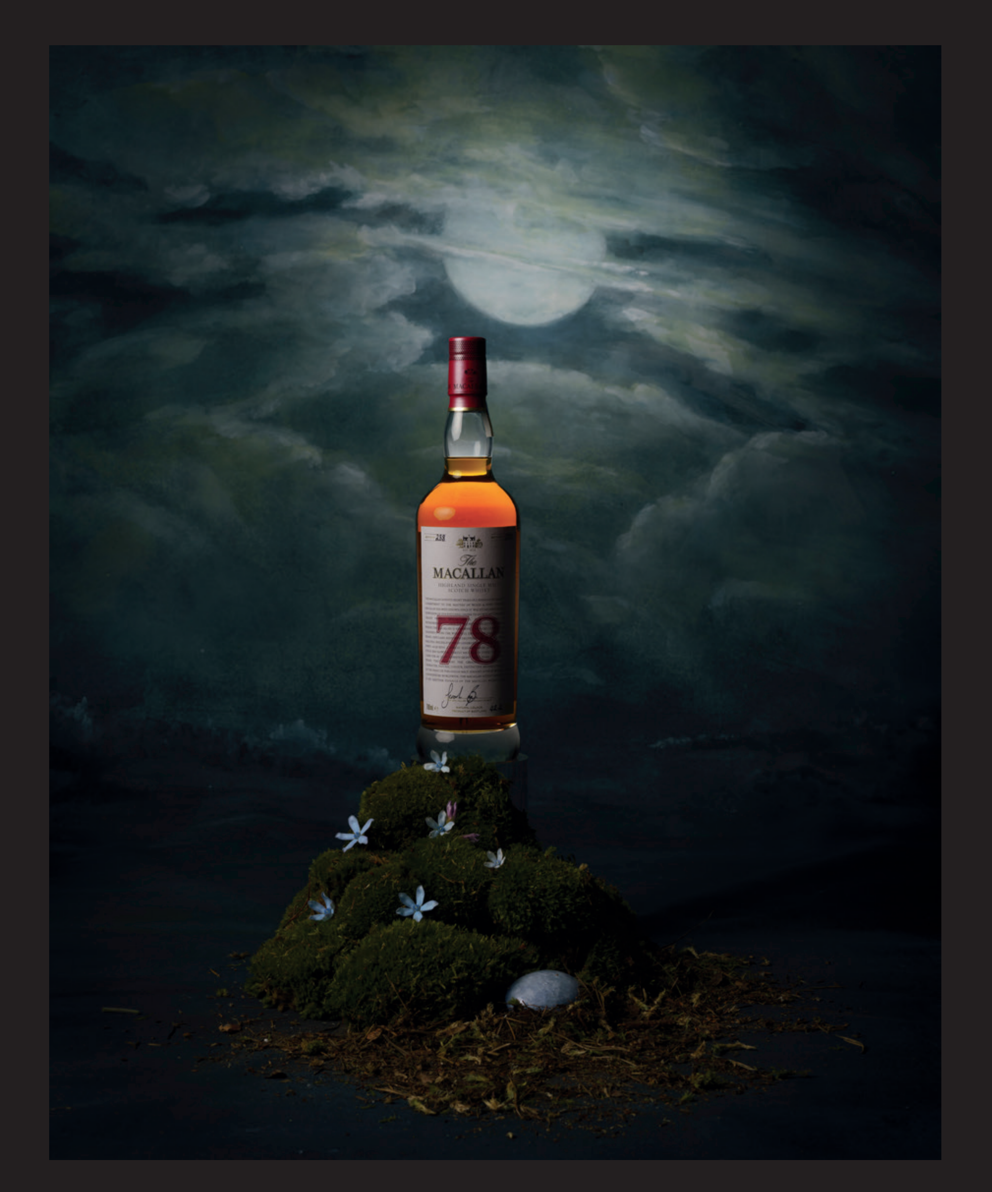
time to B wine #13 - october 2022 - ... to host an extraordinary sale