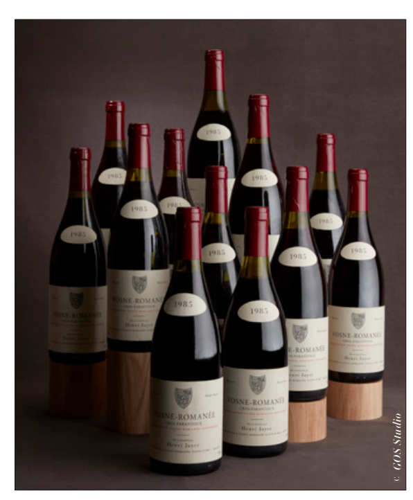
TOP LOT (#93) 12 bottles of Vosne-Romanée 1er Cru, Cros-Parantoux 1985. Estimate CHF 120'000 – 200'000