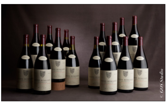
TOP LOT (#160) Vertical of 15 magnums of Vosne-Romanée 1<sup>er</sup> Cru, Cros-Parantoux, from 1978 to 2001. Estimate CHF 280'000 – 480'000

In February 2018, all the bottles were labelled and capsuled in the Domaine's vat-room, by Emmanuel Rouget and Monsieur Jayer's daughters, in view of the sale. The bottles and magnums were then escorted to the Geneva FreePort, where they are currently being kept in perfect temperature and hygrometric conditions.