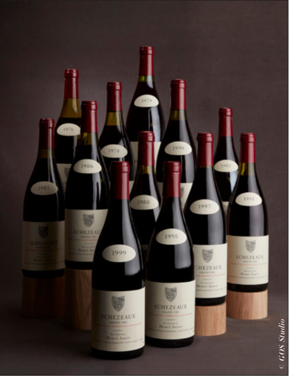
TOP LOT (#202) Vertical of 12 bottles of Échézeaux Grand Cru, from 1976 to 1999. Estimate CHF 40'000 – 80'000