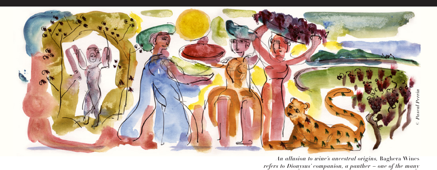
BAGHERA WINES, A NEW EXPERTS OFFICE DEDICATED TO EXCEPTIONAL WINES