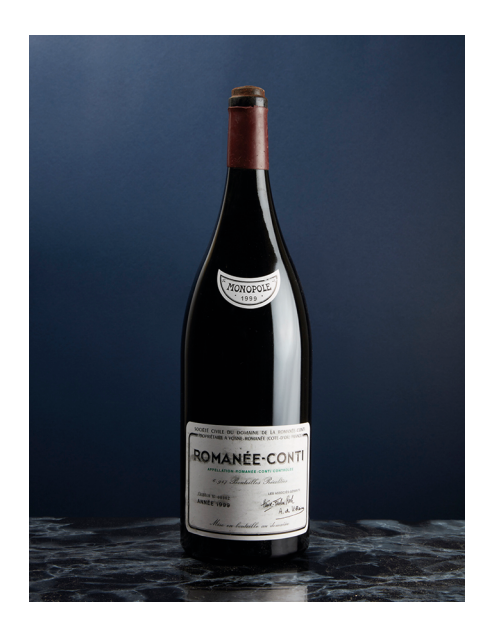
Lot 36 1 jeroboam of Romanée-Conti 1999 Domaine de la Romanée-Conti CHF 82'800

CHF 82'800 (approximately 76'300 €) — this is the price at which a jeroboam of Romanée Conti 1999 soared to on Tuesday June 6th during the latest Wine O'Clock *, 100% online wine auctions signed by Baghera/wines.