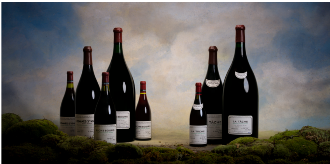
A selection of Domaine de la Romanée-Conti wines composing this admirable collection.

Sunday March 1st, 2020 from 2 p.m. Beau-Rivage Hotel lounges, Geneva