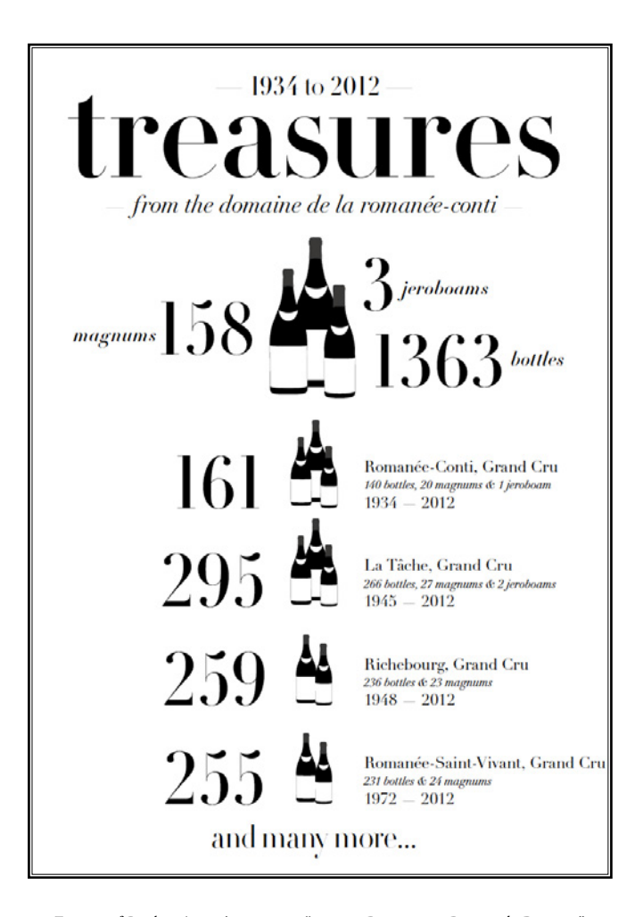
Extract of Baghera/wines' magazine "time to B wine #3, Burgundy Dreams", issue dedicated to the December 2018 auction to come.

Baghera/wines is pleased to highlight these hidden treasures and to offer at auction these exceptional bottles, magnums and jeroboams. This thrilling and already historic Domaine de la Romanée-Conti wine collection will enthuse all sharp and demanding Burgundy collectors.