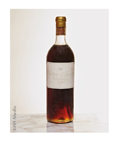
i bottle Château D'Youem — 1848 Estimate: CHF 15,000 ~ 25,000

An allusion to wine's ancestral origins, Baghera Wines refers to Dionysus' companion, a panther – one of the many allegorical attributes of the Greek god of vine and wine. Spirit of Bacchanalia =3